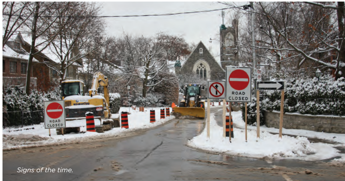
Signs of the time.

Green spaces will be planted inside curb bump-outs and other extensions and maintenance of these green spaces will be the responsibility of the adjacent landowners. (In one case at Binscarth, pavers rather than greenery will fill in the additional space).