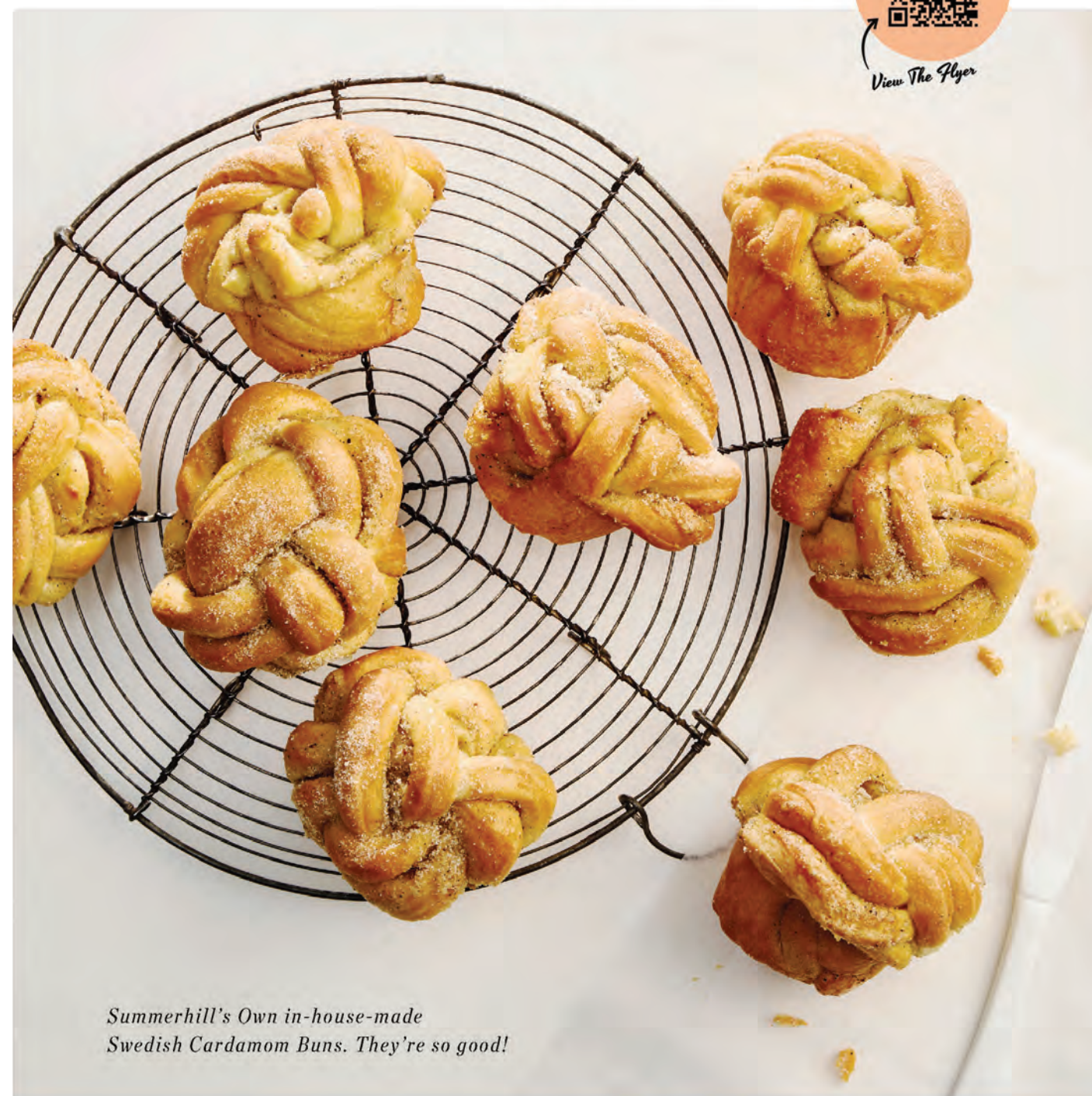
Summerhill's Own in-house-made Swedish Cardamom Buns. They're so good!

"Thank you for your continuous support North Rosedale!"